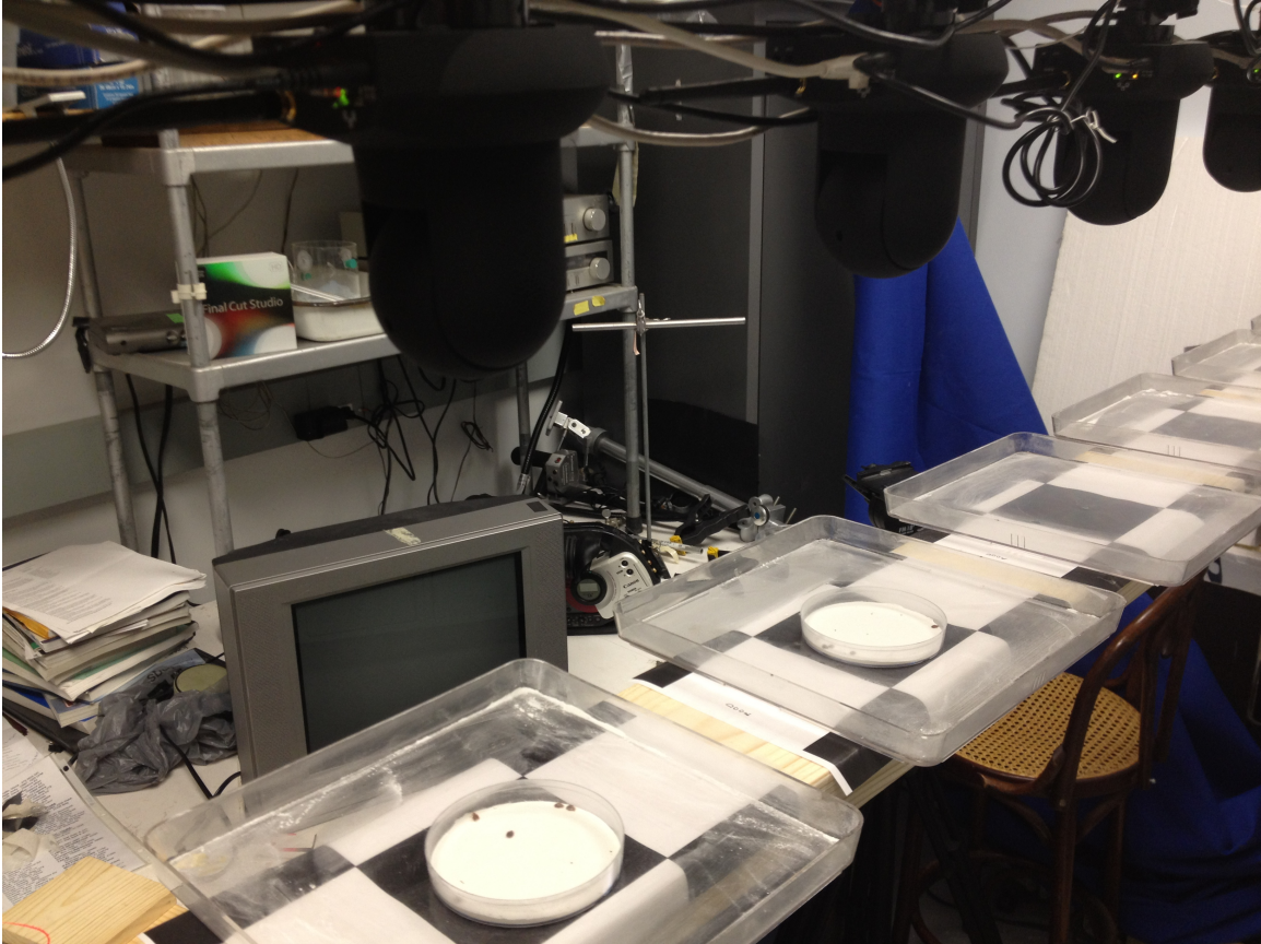
Figure 2. Closeup showing cameras and dishes containing bed bugs.

A video from one of the cameras is at: http://anitracks.com/c1/bedbugs.avi .