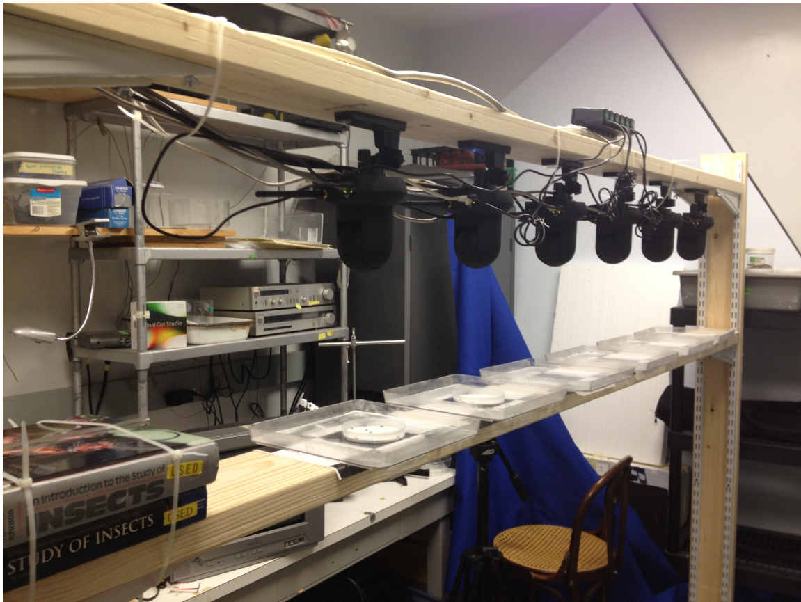
Figure 1. Setup showing the 6 cameras and supporting frame.

We have the testing setup finished and have preliminary experiments finished. Figures 1 and 2 show what the setup looks like. We have 6 cameras on a frame directly over 6 petri dishes of bed bugs. The outer dishes act as a backup containment vessel since the dishes of bed bugs have to remain uncovered.